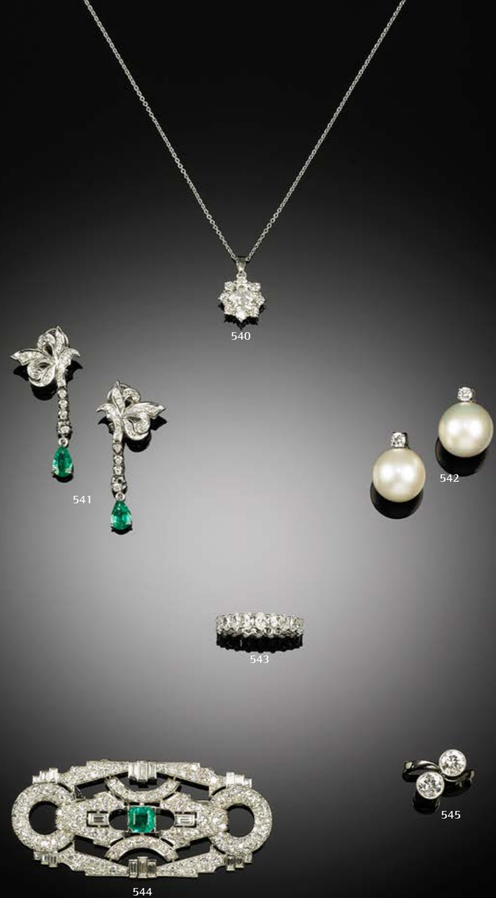
541 A pair of emerald and diamond ear pendants each set with a pear-shaped emerald and numerous brilliant-cut diamonds, mounted in 18k white gold. L. 4 cm. (2) DKK 12,000–15,000 / € 1,600–2,000